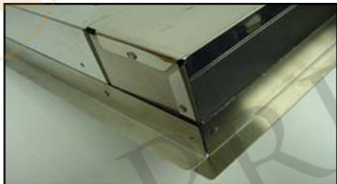
3/4" Flange for perfect fit.

SEVEN YEAR, IN HOME, LIMITED WARRANTY ON INSERT, THE BEST IN THE INDUSTRY!